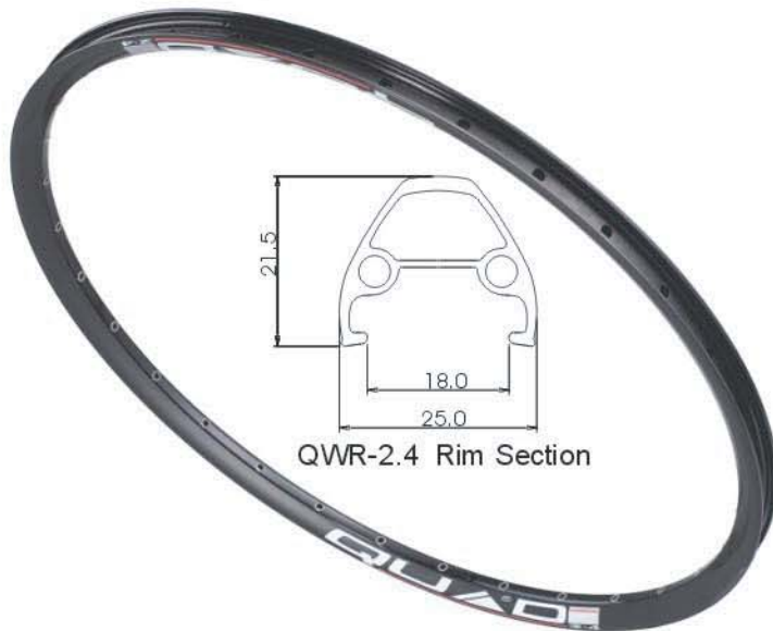
QWR-2.4 Rim Section