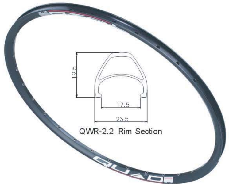
QWR-2.2 Rim Section